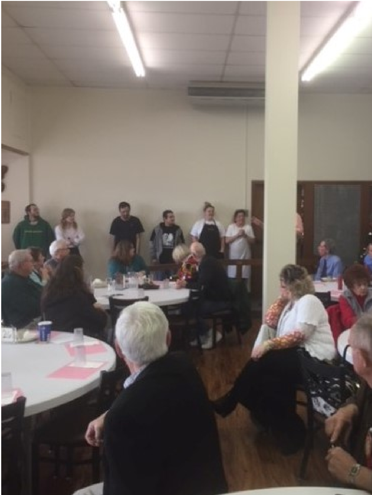
The Coquille Rotary gave a Christmas gift to those who serve, those who serve. Our club presented a $300 gratuity gift to cooks and servers of