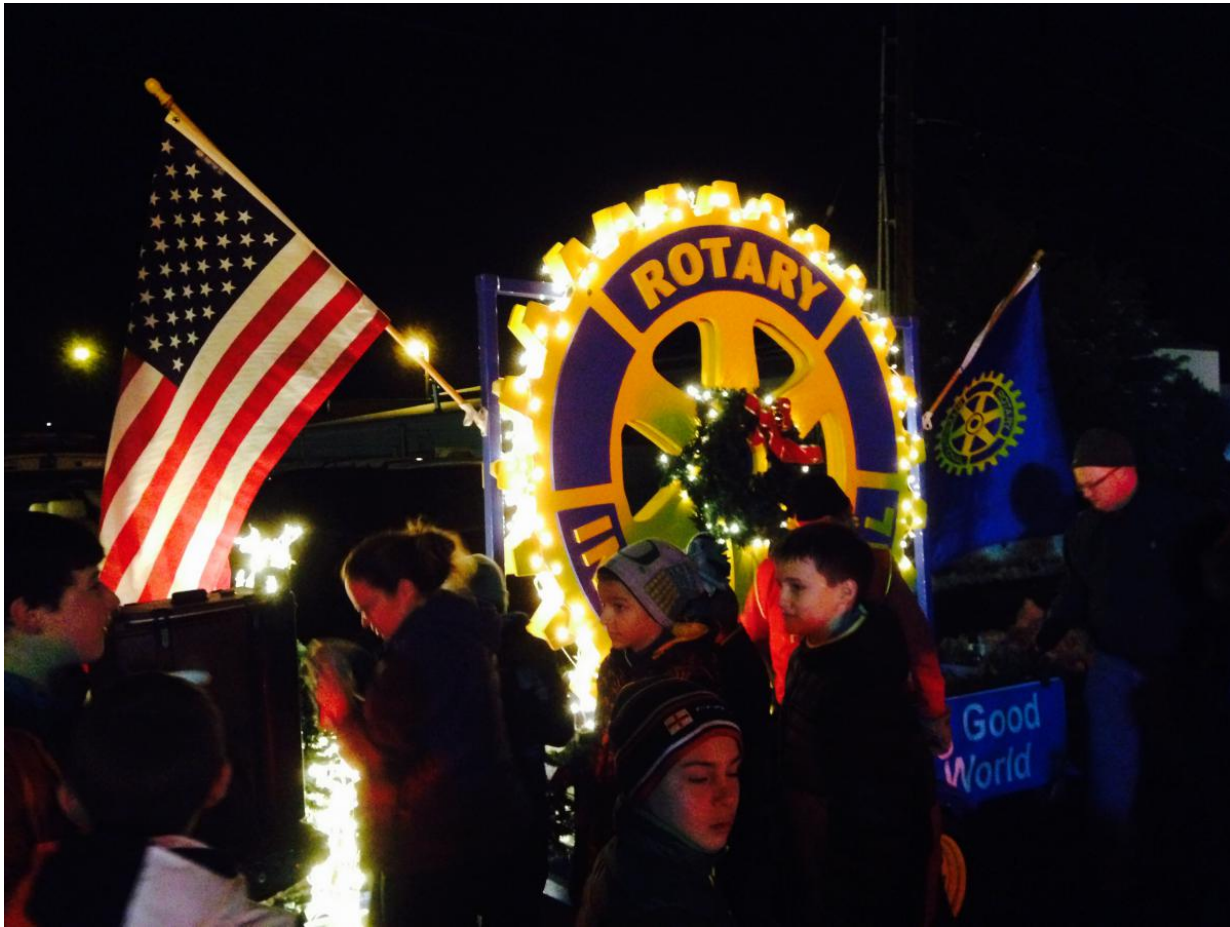
Picture is of the Rotary wheel built by Klamath County Rotary Club being pulled down Main Street on December 8th, during the annual Snowflake Parade. This was one of 100+ floats.