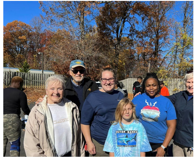
Packing Thanksgiving food boxes at Community Palooza