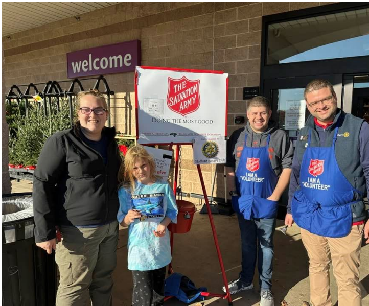
The annual Ringing the Bell for the Salvation Army