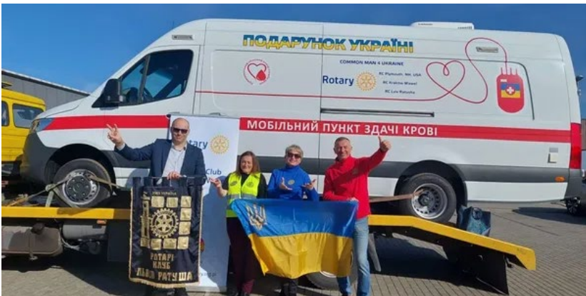
A Donated Bloodmobile

There is a trauma and education center in Poland to help refugee children learn Polish and English. They also offer counseling and legal support.