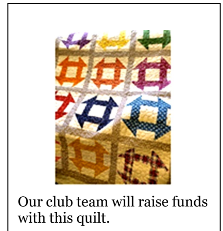
Our club team will raise funds with this quilt.

https://secure.acsevents.org/site/STR?fr_id=111788&pg=team&team_id=2848743