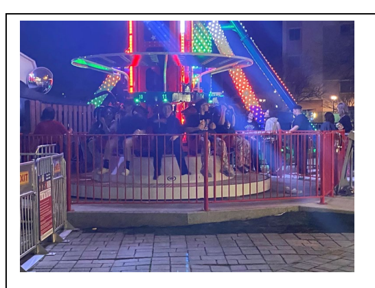
After Prom at Funland