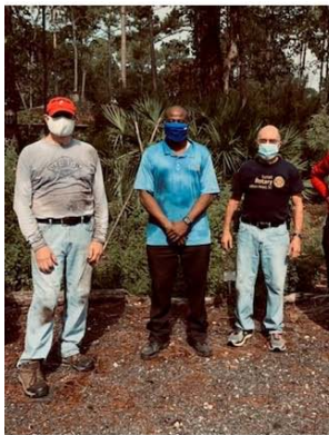
@ Newhall Audubon Preserve