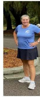
@ Deep Well