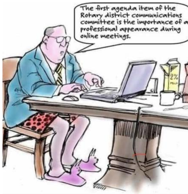
RLI Virtual Participant in action

We heard you. Our 17 September event has been changed to a virtual event via Zoom RLI ♦D7730 Virtual event scheduled for Friday, September 17, 2021 in Jacksonville, NC