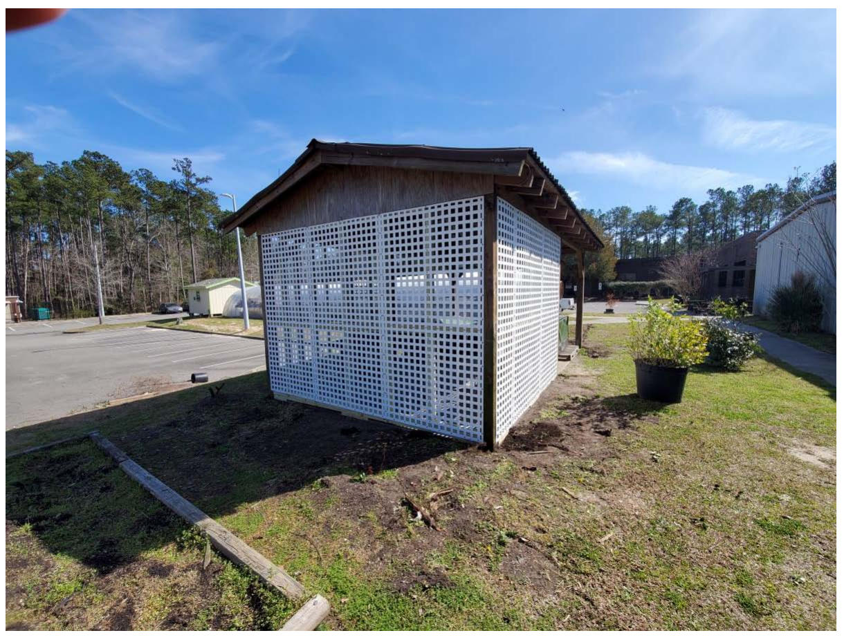
The wheels are now in motion to start the Rotary rehab project at The BIP greenhouse on the campus of Brunswick Community College.

Phase 1 includes the clearing out of brush and replacing trellis on 3 sides of the outbuilding, trenching and replacing garden timbers for planters between the greenhouse and the outbuilding. On the parking lot side of the greenhouse we plan to build lengthy planting beds with new garden timbers. It is important that these tasks get completed before the planting season gets underway. These tasks are low cost but labor intensive so volunteers are needed.