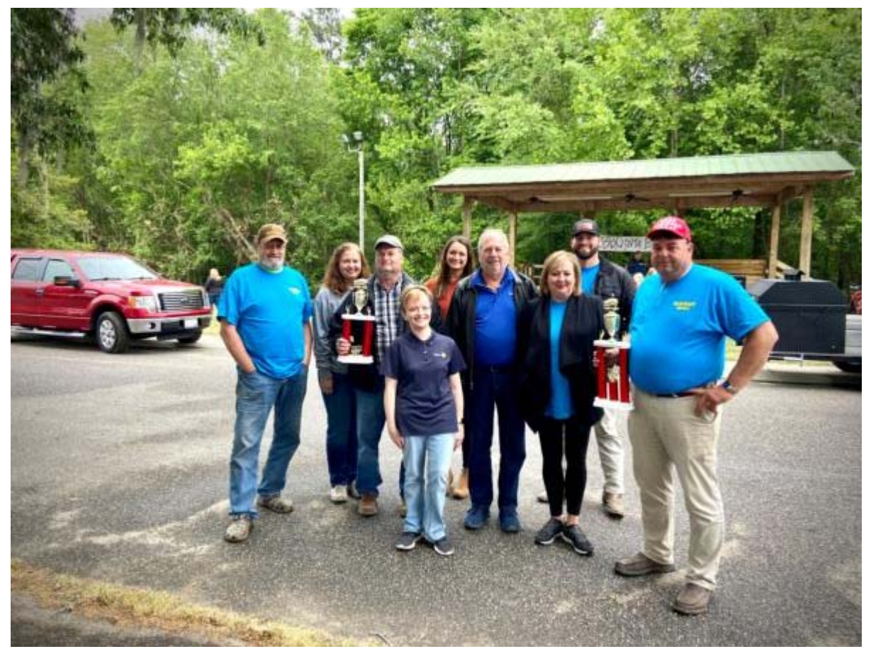
On April 24, Fair Bluff Rotary participated in BBQ on the Bluff. The annual event is a competition among teams to see who can cook the best BBQ. This year was the first year Fair Bluff Rotary entered the competition. The Fair Bluff Rotary club won the local divison and second place in the showmanship competition. After the competition, all the BBQ cooked among the teams was given away to the local community to show appreciation. Read More