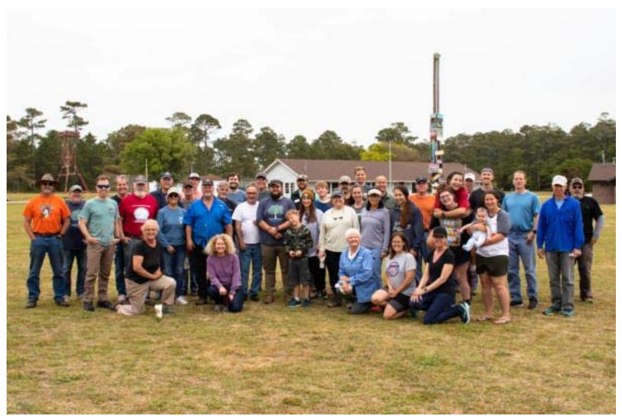
Beaufort Ole Towne Rotary Club Supports Camp Albemarle

Our Rotary club was able to team up with Camp Albemarle, a youth camp program that takes great care to make certain that no child is denied an experience at their camp.