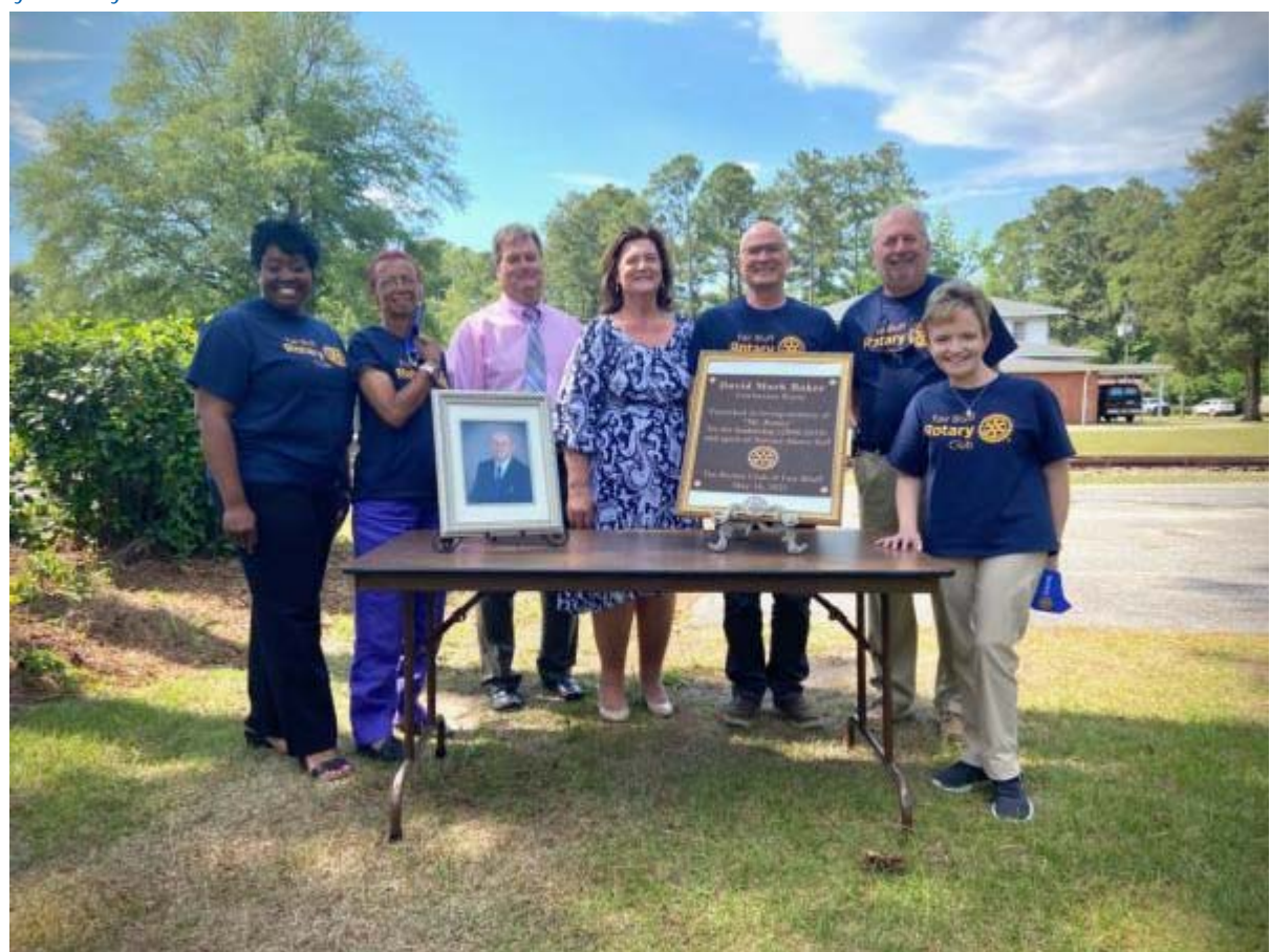
The Rotary Club of Fair Bluff publicly presented a donation to the Fair Bluff Community Library on Sunday, May 16<sup>th</sup>. The donation was part of the dedication ceremony for the recently renovated library. With the assistance of a matching district grant, the club donated a conference table and chairs to furnish the recently constructed conference room. The table has various connections for electronic devices. The conference room will be available for community groups to use as the town works toward revitalization. Read More