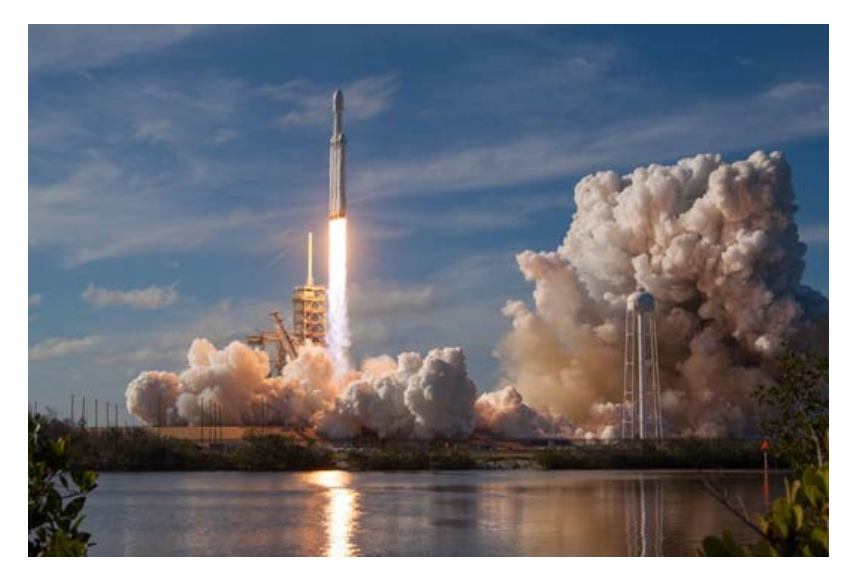
Launching the District Grant Application period.

You can now apply for your Clubes District Grant for the 2021-22 Rotary Year.