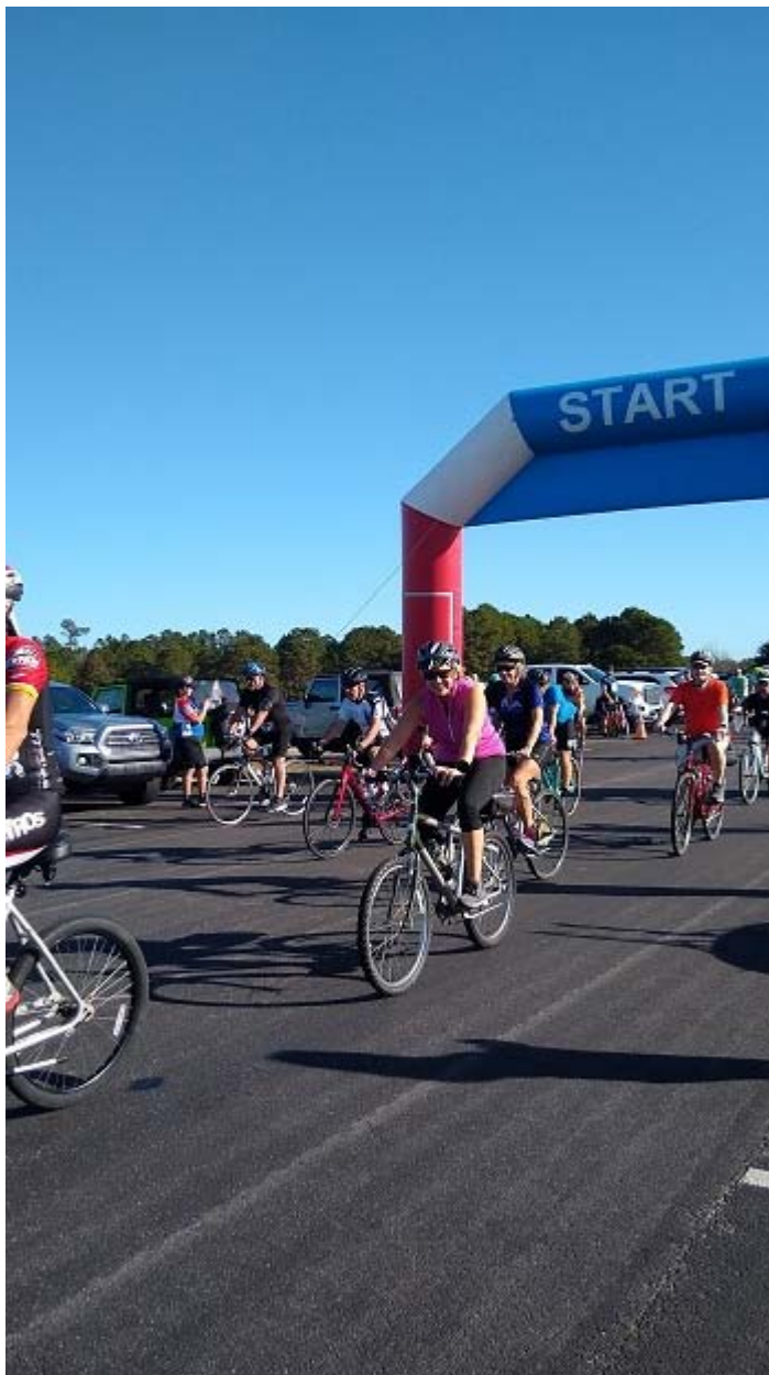
Crossing Holden Beach Bridge