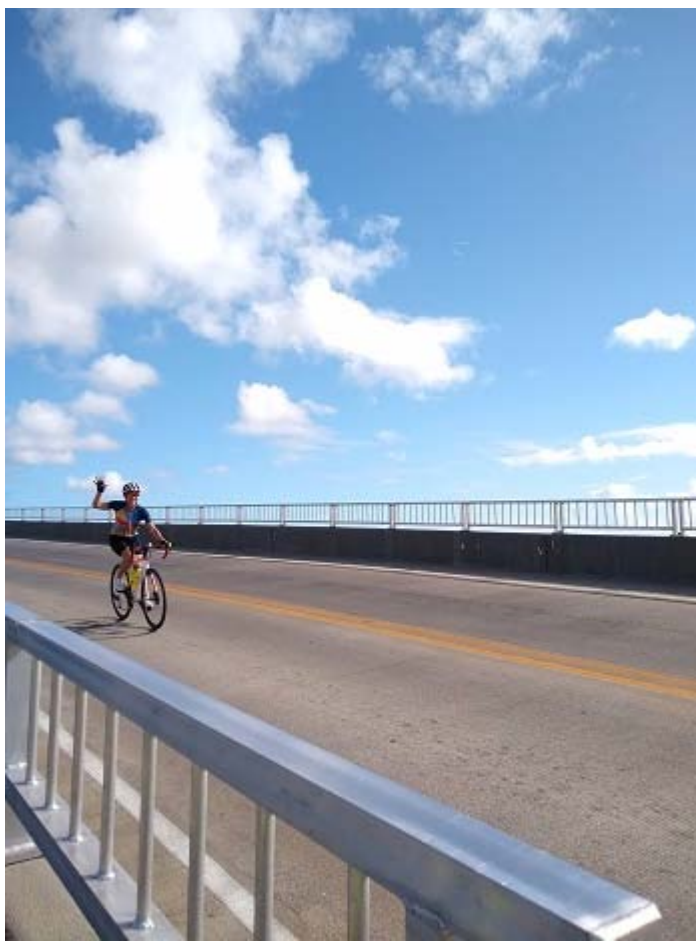
Socially Distanced Rest Stop