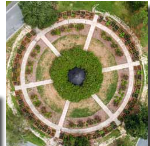
Drone photograph above dramatizes poor condition of grass in Rotary Wheel Garden, which the city says is solely our responsibility. At left, a view of the garden and amphitheater, both Rotary Club gifts to the city, and the place they hold along Greenfield Lake's western shore.