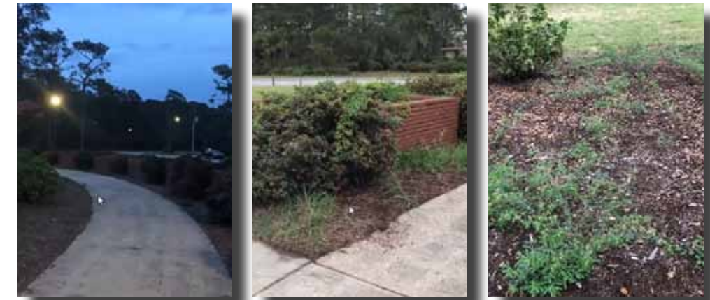
Images from video show newly installed lighting; also recent weed growth in Rotary Wheel Garden.

Terry made the case that occasional volunteer work days are no substitute for the professional landscape management the Rotary Wheel Garden requires. He also recommended creating a standing committee representing this and Wilmington's other five Rotary Clubs to set priorities and budgets, and get commitments of support from the other clubs.