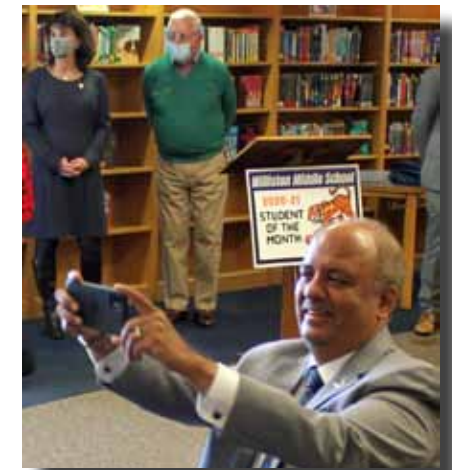
Photographing Williston student musicians.

Third stop in the Rotary president's tour of Wilmington was Williston Middle School, where he learned about our club's Legacy Project and presented our $3,725 check to support the school's music programs.