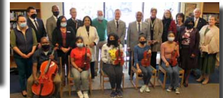
Rotarians pose with Williston students and teachers in school library.