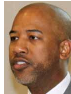
Foust: NH County Schools