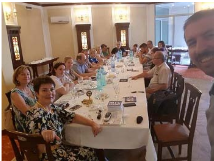
The Baia Mare Board: