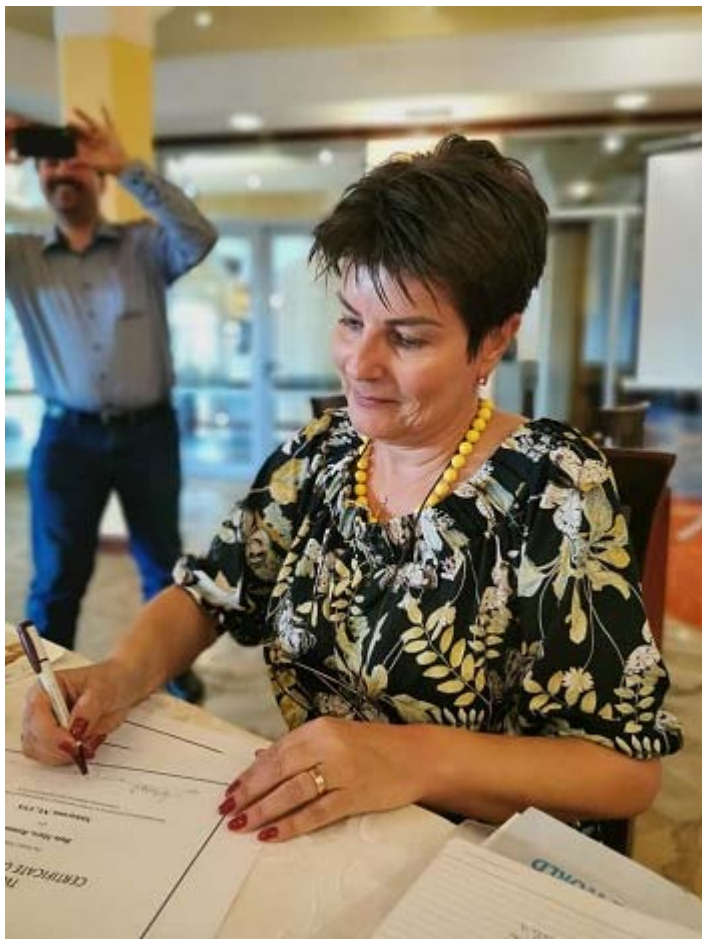
Miheala captured the signing of the Twin Club Certificate. Just a few of the members of her club in the picture below