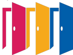
Rotary Opens Opportunities