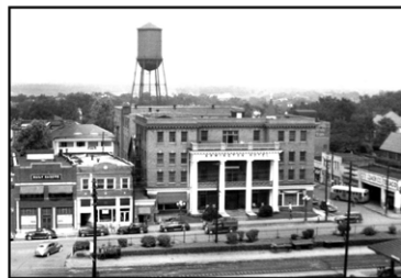
THE ARMINGTON HOTEL, DAILY GAZETTE & CITY COACH CO., GASTONIA, NC