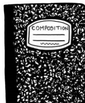
494,180 Composition Books