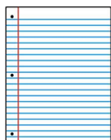
247,090 Packs of Filler Paper