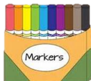
22,808 Packs of Markers