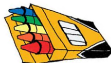
26,611 Packs of Crayons