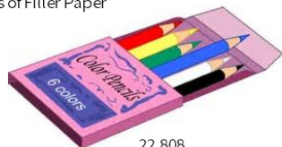
22,808 Packs of Colored Pencils