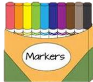
22,808 Packs of Markers