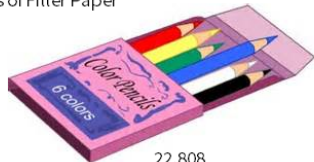
22,808 Packs of Colored Pencils