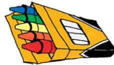
26,611 Packs of Crayons