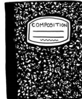
494,180 Composition Books