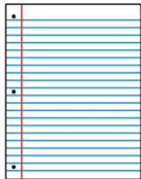
247,090 Packs of Filler Paper