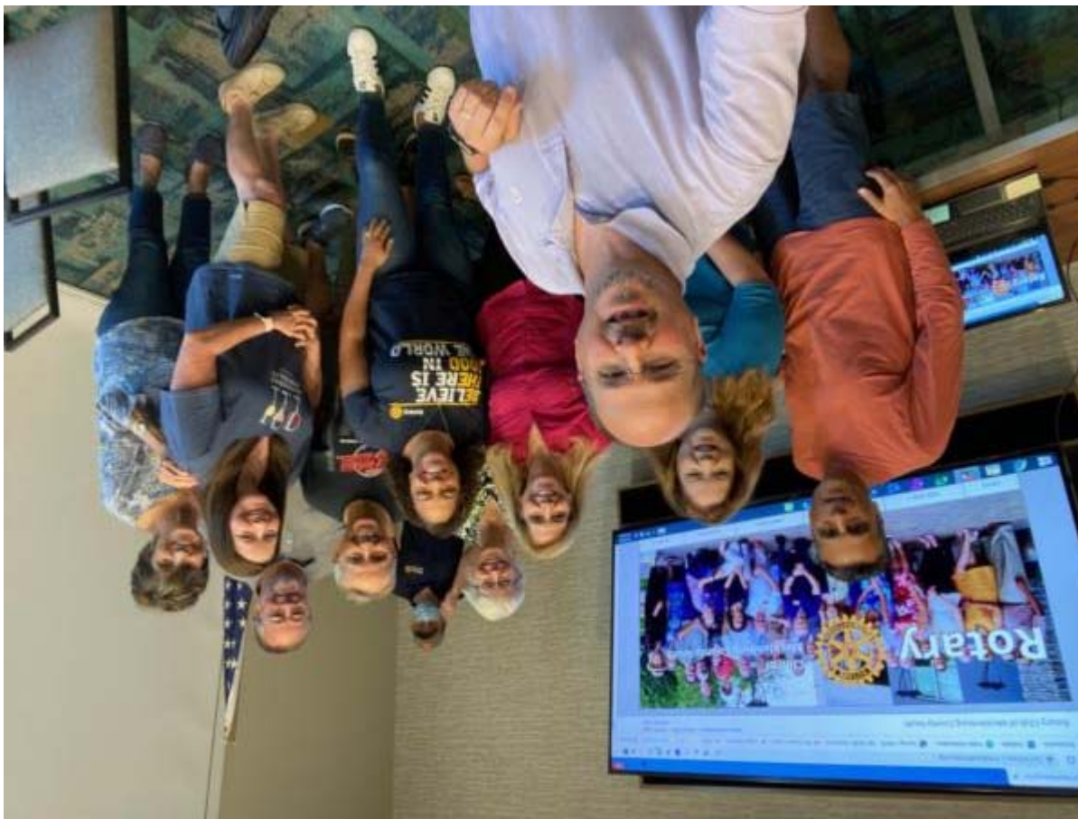
A lot was accomplished at the Meck South Rotary Board retreat! Great ideas and plans for the year!!