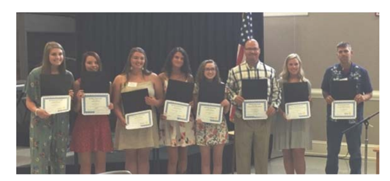
Rotary Club of Lenoir presented scholarship checks to its recipients. There were nine students recognized who received a total of $11,500. Of these, two were grants at $1000 each and seven were club funded for $9500.