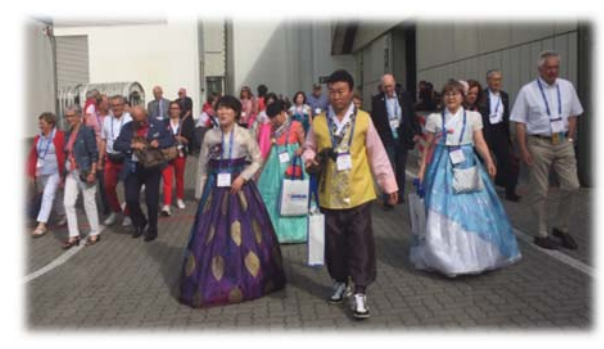
The world came to Germany

Beautiful weather and a beautiful city were the defining characteristics of this year's Rotary International convention in Hamburg, Germany. Approximately 25,000 people from around the world descended on Germany's second-biggest city from June 1-5 as Rotarians celebrated their 110th Annual Convention. The overarching theme for the week was building a stronger Rotary and adapting Rotary to a changing world through our named values: leadership, service, fellowship, diversity, and integrity.