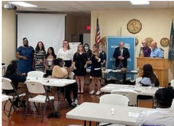
New Milford Interact Officers