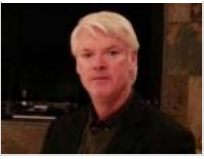
Club Membership Chair