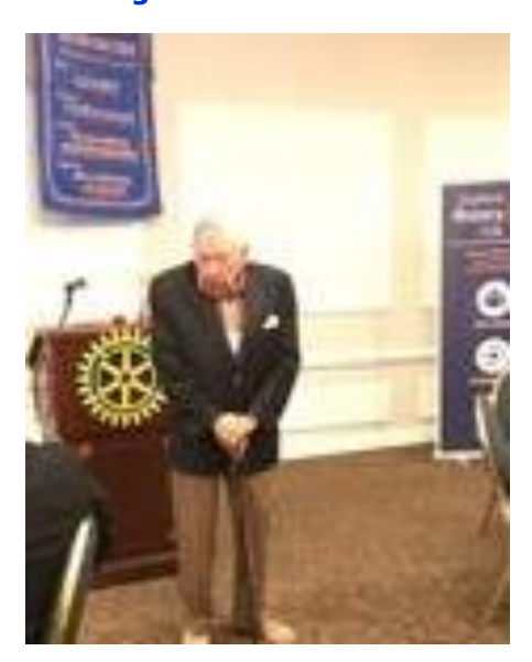
Fundraiser for S.E.R.V.E.