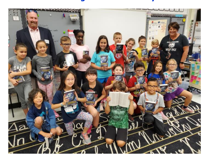
Park Ridge Elementary