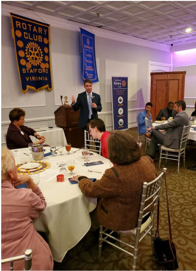
Representative Rob Wittman was our guest speaker on March 20.