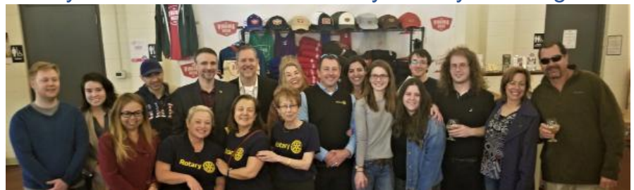
These clubs sponsored a fundraiser at the Virginia Beer Company to benefit a local girl with multiple handicaps. Area Rotary Clubs and friends of Rotary joined to raise $1,100+

Rotaract Club of Williamsburg and the Rotaract Club and Rotary Satellite Club of James City County work together: