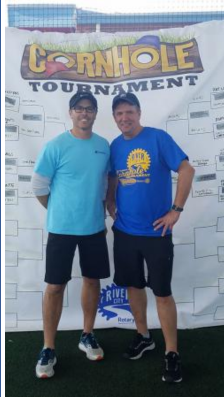
Last Saturday, the River City club held it's cornhole tournament. The overall winner was the Fort Lee Federal Credit Union #2. They are not only the winners but a sponsor as well.