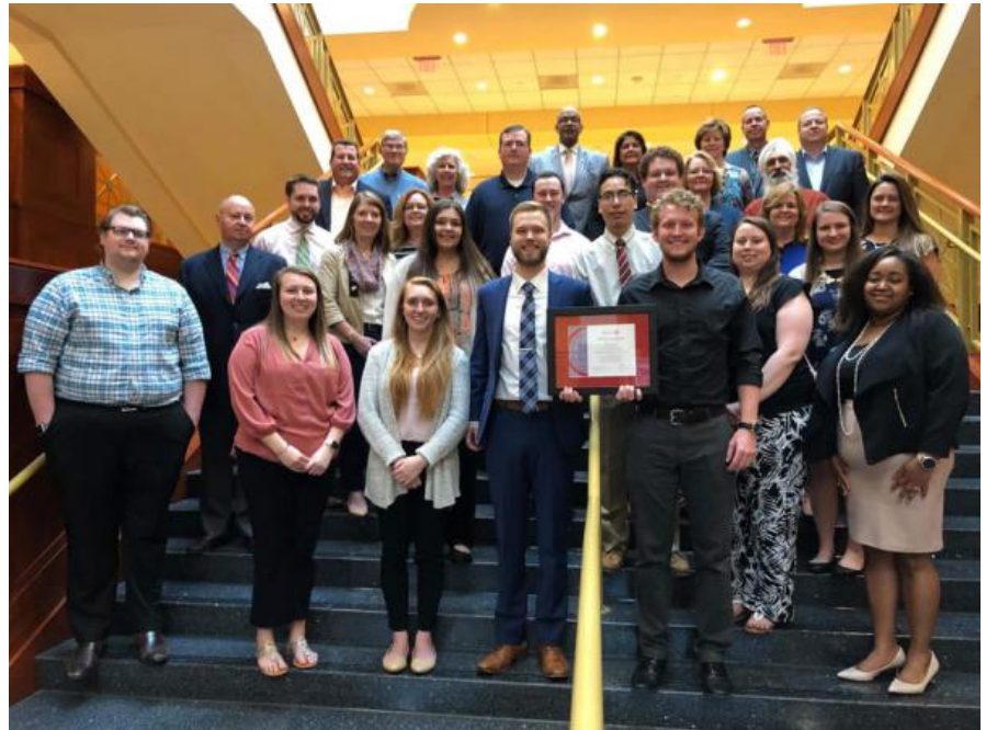
On Monday, April 8, 2019, the Rotaract 757 Peninsula club received their official Charter. The established of the club was made possible by members of four dedicated Rotary Clubs on the Peninsula, who realized there was a void in the community that needed filling. Congratulations!

Rotaract Club of Williamsburg and the Rotaract Club and Rotary Satellite Club of James City County work together: