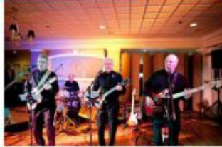
The "We're Not Dead Yet" Tour

The group that's been playing the oldies since they were new