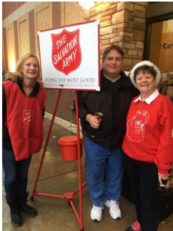
THE Rotary Club of Richmond ...