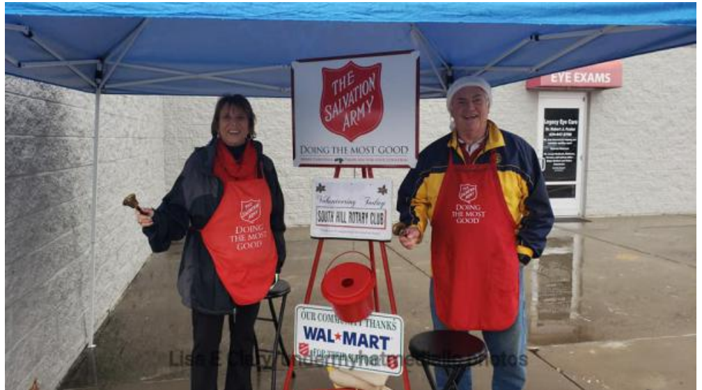
South Hill Club ...