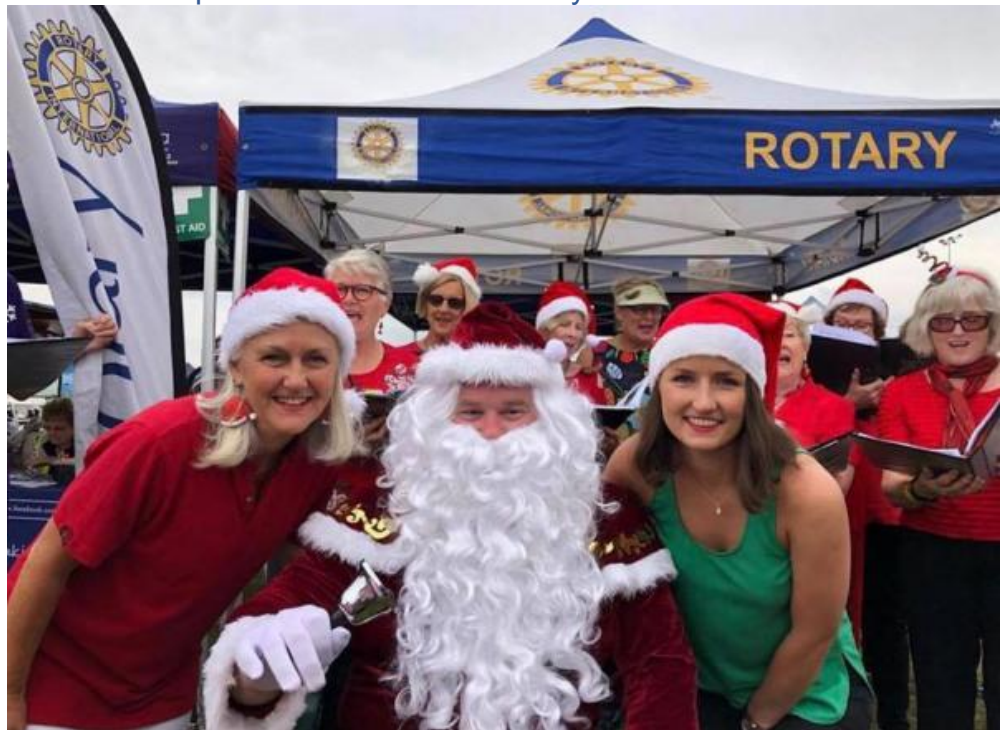
Members of the Hampton Rotary Club enjoyed the festive spirit at the Bayside Farmers Market including entertainment by the Vocally Wild Choir. They will participate again at the next market on Saturday, January 19th.