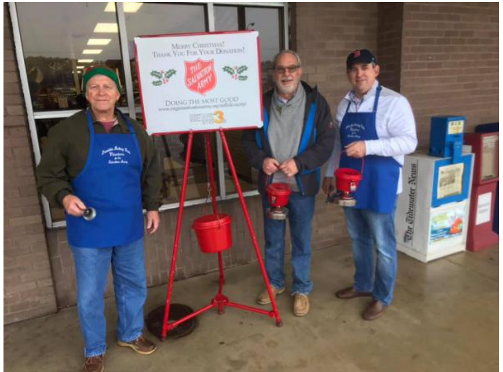
Franklin Club ...