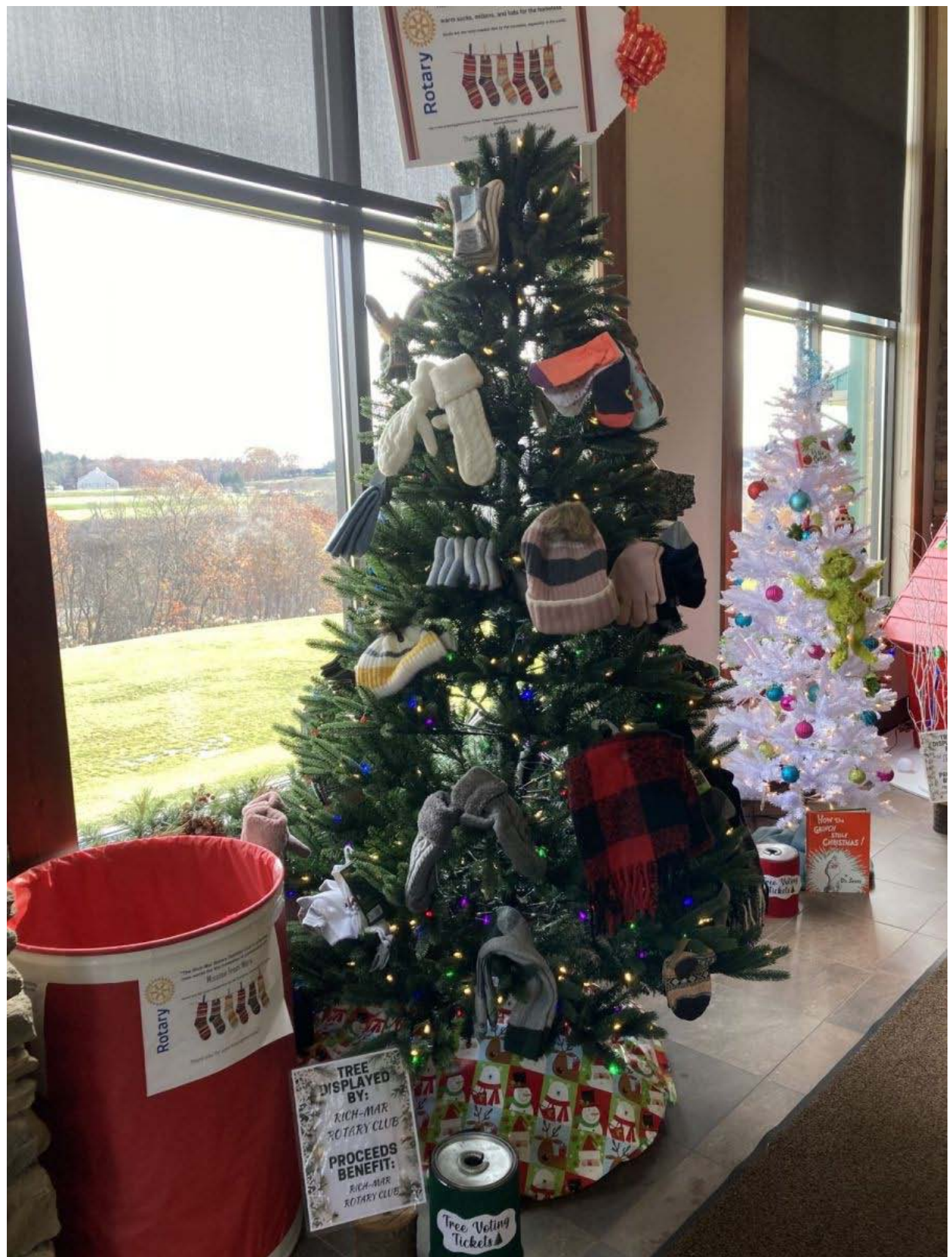
Visit the Pine Community Center during this holiday season. View the Christmas tree erected by the Rich-Mar Satellite Club. While you are there donate to the sock drive.