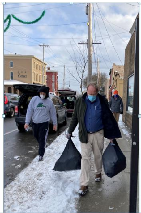
Photo from Jean Project delivery Dec. 29, 2020