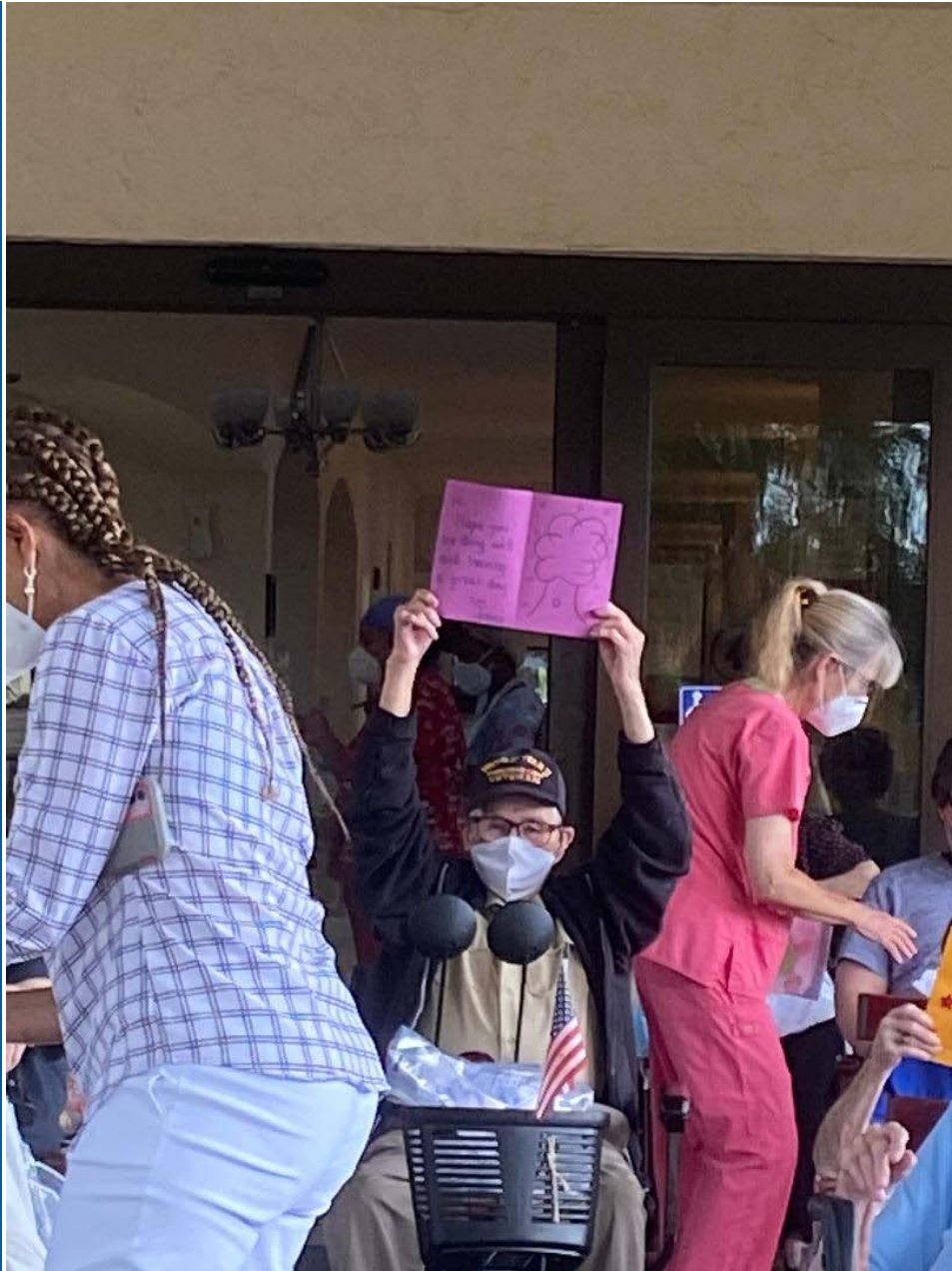
Sunnyhills Nursing Home friend, age 101!