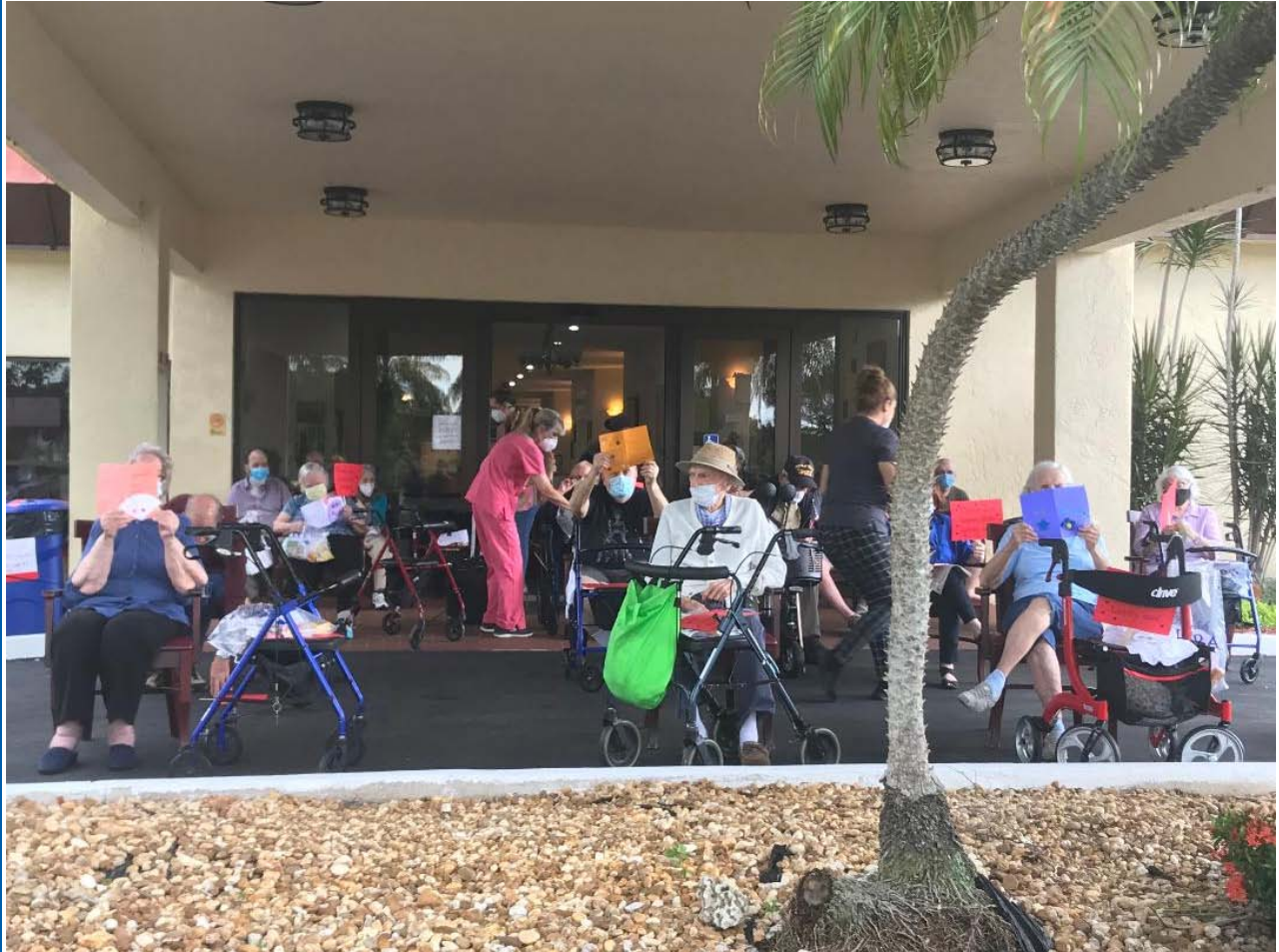
Sunnyhills Nusing Home crowd on August 19th visited by Rotarians!