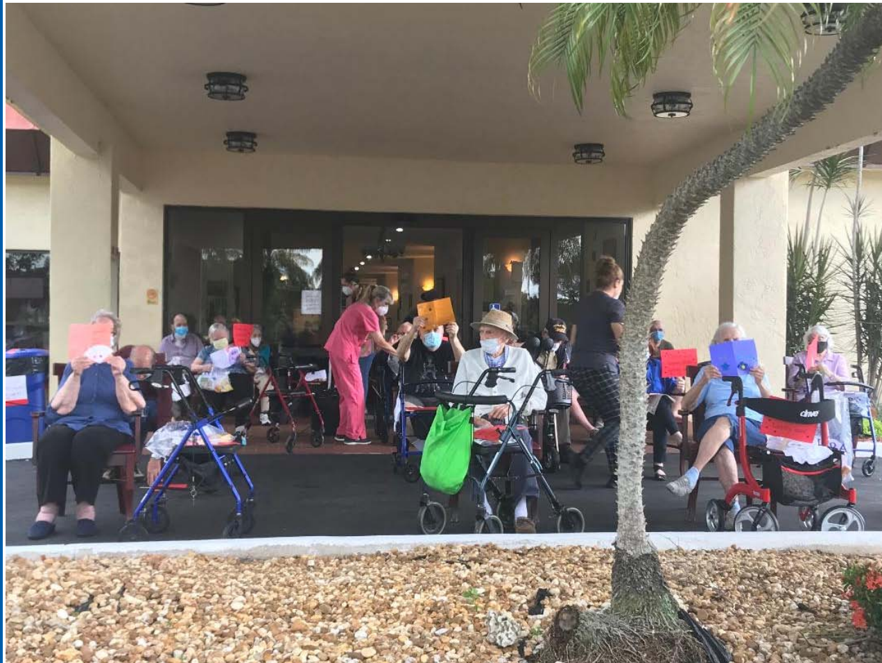
Sunnyhills Nusing Home crowd on August 19th with letters from elementary students.