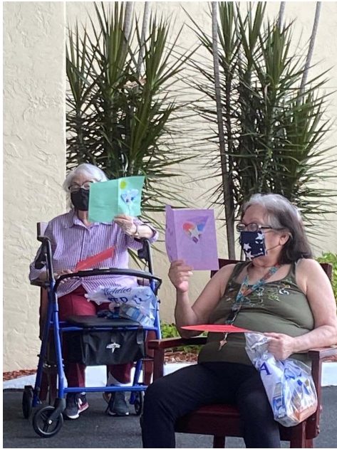
Sunnyhill residents with student 'Well Wishes', August 2020