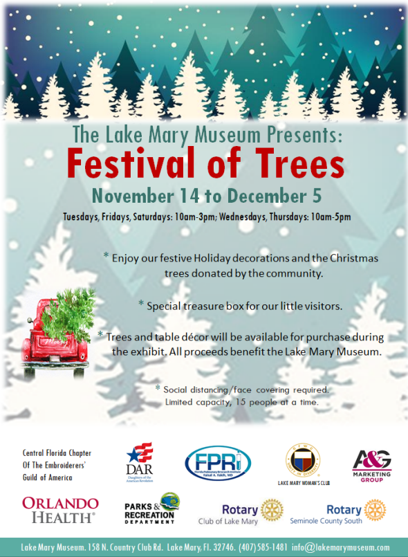
Exhibit hours: Tuesdays, Fridays, Saturdays: 10am-3pm Wednesdays, Thursdays: 10am-5pm Free admission. Donations are always appreciated.

* Social distancing & face covering are required. Limited capacity.