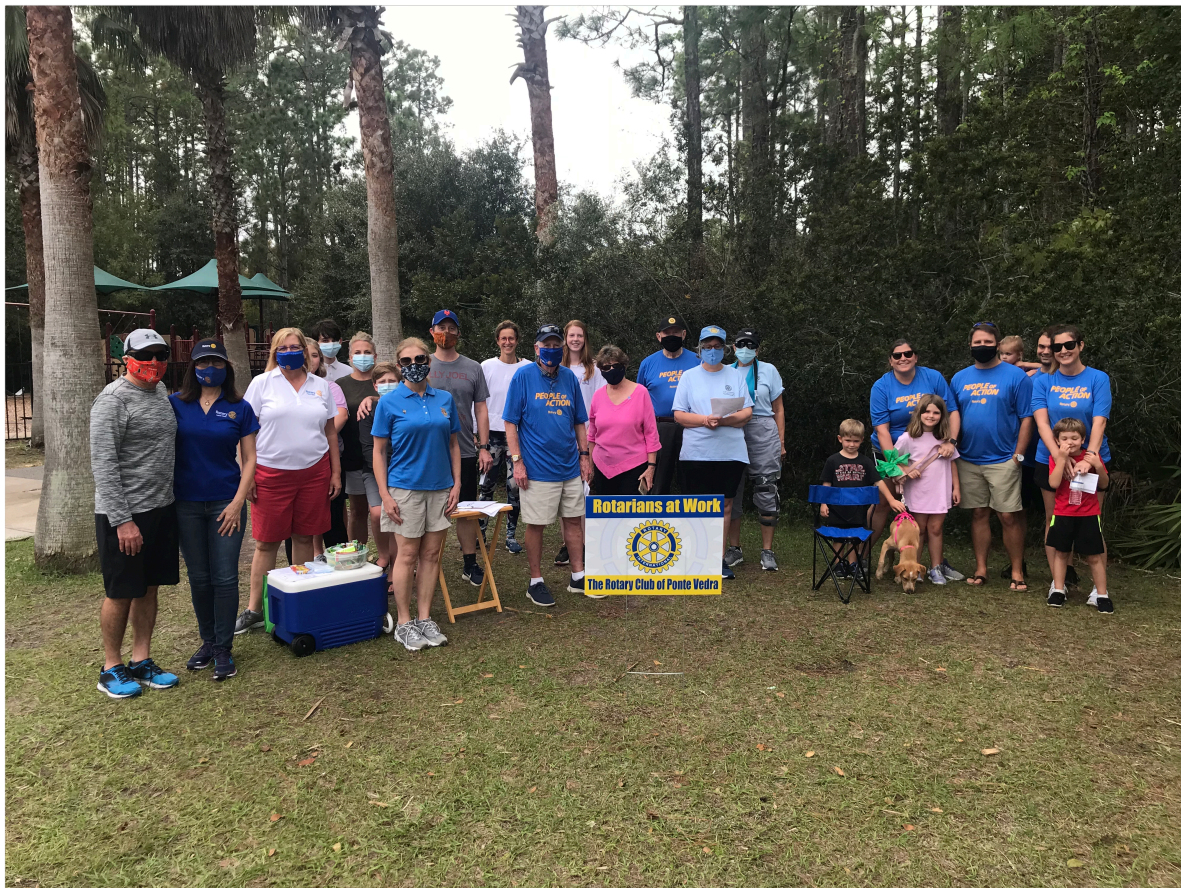
Those who took part in last year's Autism Speaks Walk.

It's October already and time again to support one of our club's signature service projects: the Autism Speaks Walk! This year's Walk is planned for Saturday,