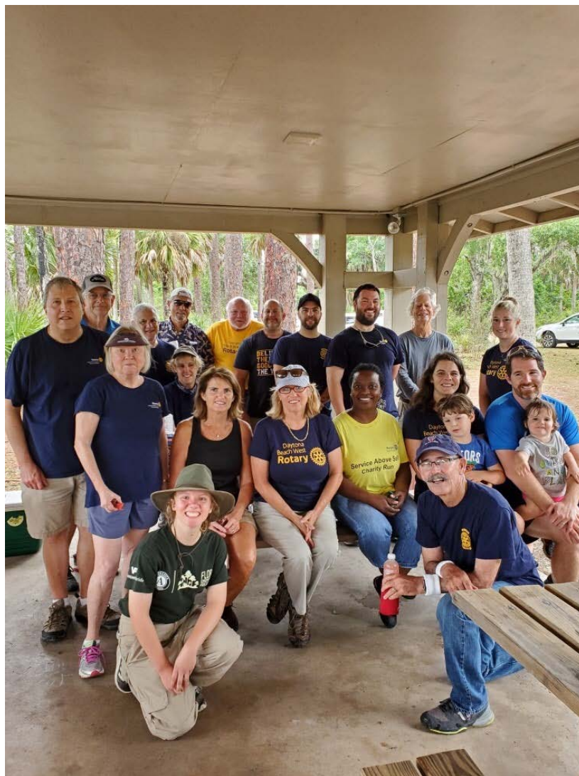
Barbeque, June 8, 2019 - Rotary Clubs of Downtown Ormond Beach and Daytona West