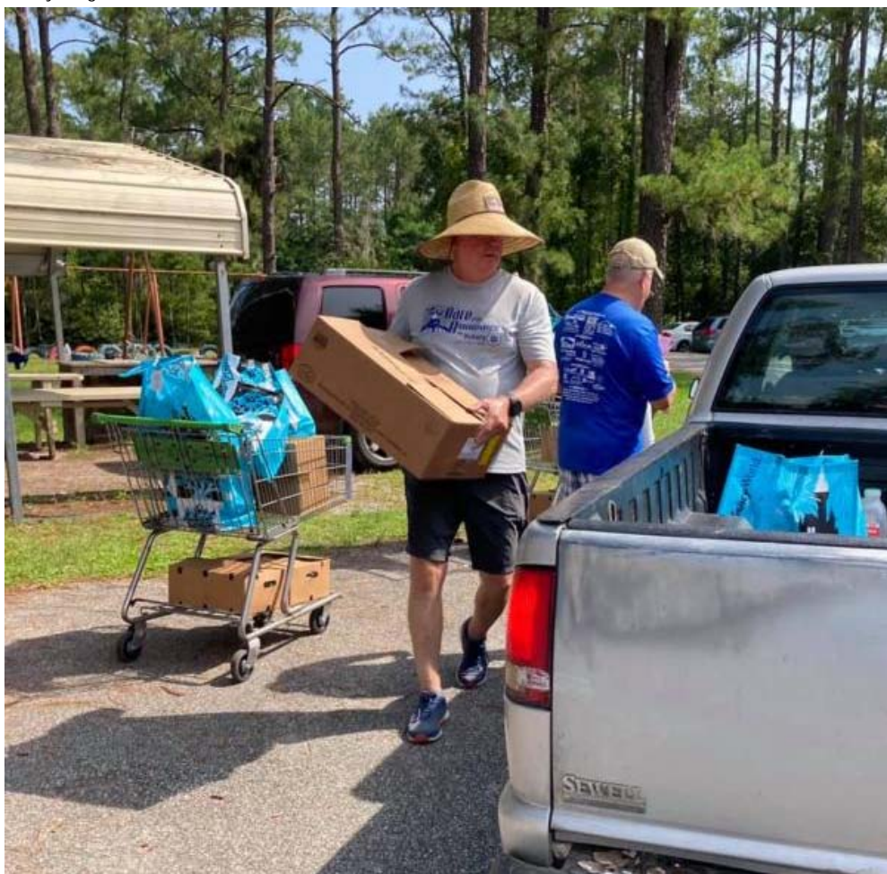
Many thanks to all Rotarians, Interactors, friends and community members who came out to Pierson on July 28 to volunteer at the Rotary Club of Flagler Beach Project Share food distribution. We may have hit a new record for most volunteers ever! Read More