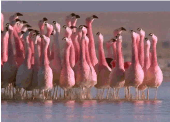
Vibrant Club Seminar/District 6970 All-Flamingo Celebration! Read More