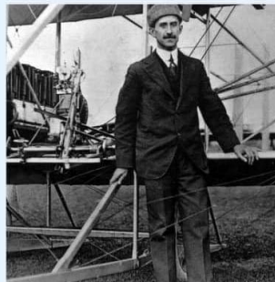
Orville Wright Pioneering Aviator Rotary Club of Dayton OH

Orville and his brother Wilbur were two American aviation pioneers generally credited with inventing, building, and flying the world's first successful motor-operated airplane.