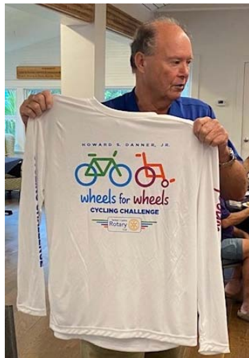
Wheels for Wheels is Coming!