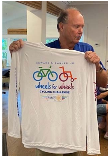
Wheels for Wheels is Coming!