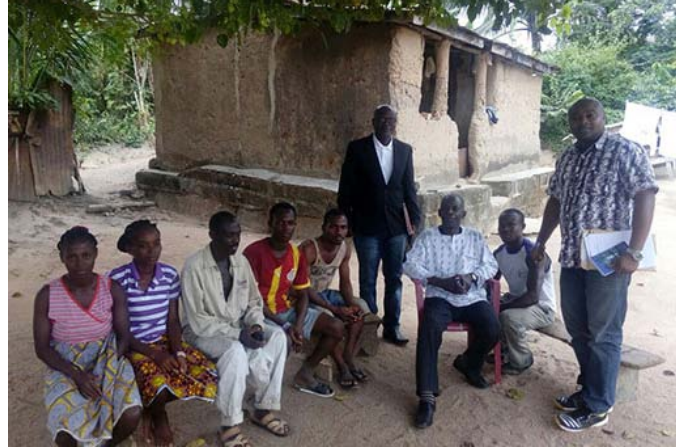
Meeting with community leaders in Nsuobri village.

I was not surprised when in two of the five villages we visited, we were mistaken for politicians, since it was close to national elections. But this gave us the opportunity to further explain and brief them on the activities of Rotary, and of course to mention our End Polio program, which some of these villagers had seen or heard about.