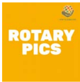
July 13 Meeting & Red, White & Boom!