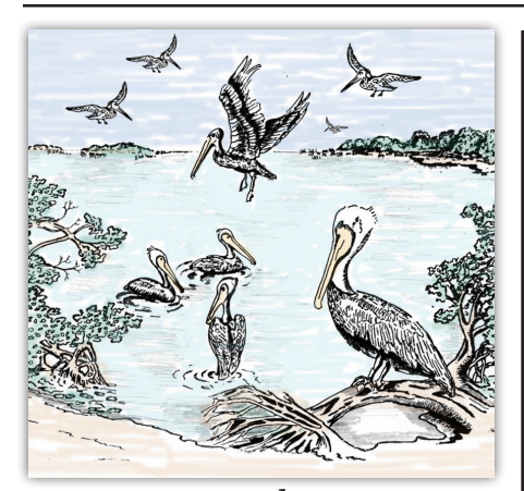
Issue 15: November 3, 2021

Our club welcomes all visitors. Why not join us either by zoom and in person on Wednesday mornings?