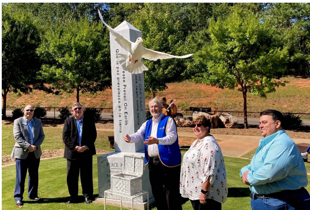
Rotary Club of Jasper releases a symbolic dove during a Peace & Unity Day event on September 21.

To top it all off, Rotary Clubs across Georgia were celebrating the day with a wide array of special events to help bring peace into each community in a unique and positive way. Outlined below are a series of links that will lead you to a variety of stories and photographs from some of the awesome programs that took place in District #6910 on the International Day of Peace.