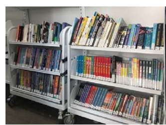
Rotary Club of Sugarloaf: Mobile Library Program