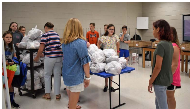
Banks County Rotary: Food2Kids Program

Global grants support Alliance for Smiles providing free surgery to those born with cleft lip/palate. HANWASH will provide clean water in Haiti. Peace Scholarships and the support of Global Grant scholarships. So many more accompany those few.