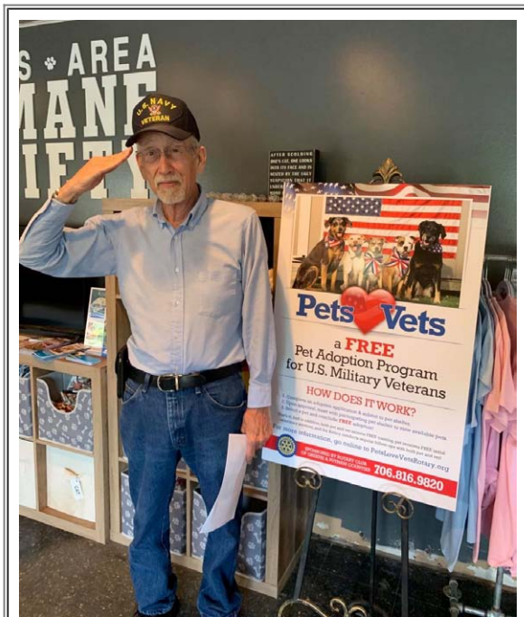
Morgan County Rotary Club: Pets Love Vets

Below are just a few pictures of our how your donations support programs in your community and in our world.