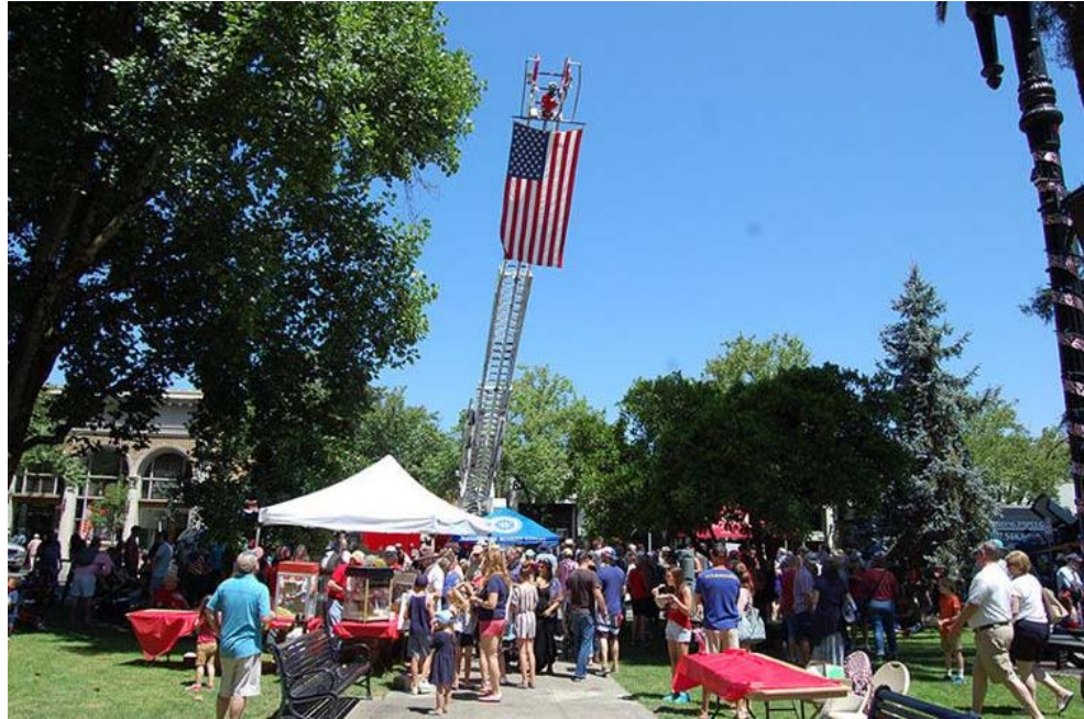
Fourth of July in Healdsburg pre-pandemic.