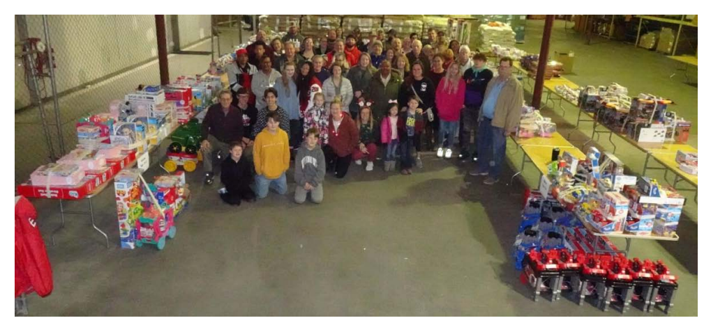
2019 Empty Stocking Fund delivery day

The meeting will be in the conference room to the right as you come in the door of the church.