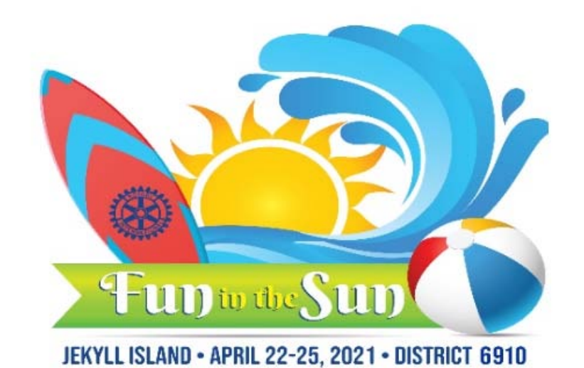
Register NOW! Info on meeting safely on Jekyll Island