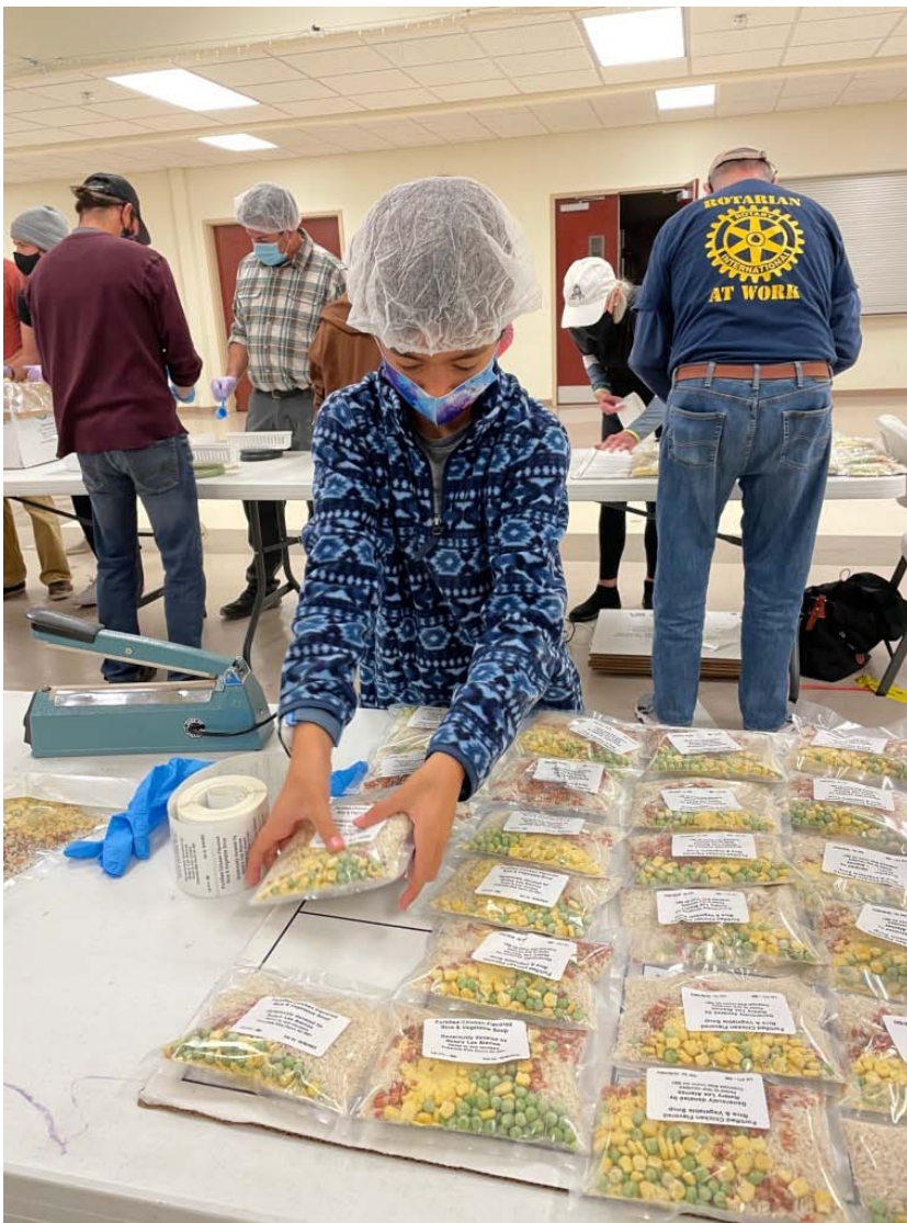
Just a few of the 25,000 food packets from Saturday morning's Meals of Hope event.