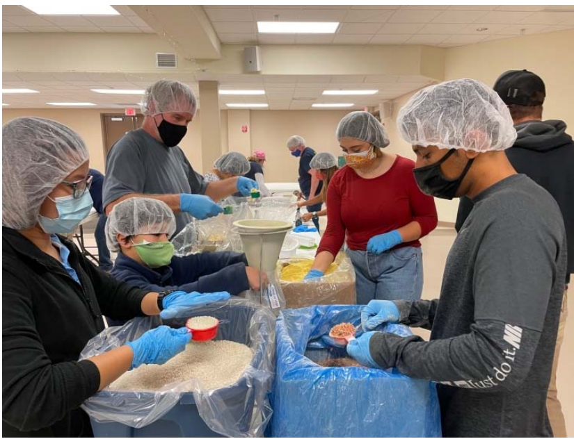
Volunteers of all ages participated in Saturday ♦s Meals for Hope event.