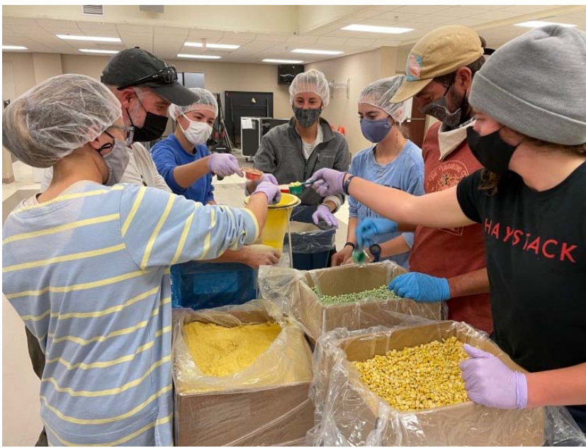
Volunteers hard at work but having fun Saturday morning during the Meals of Hope event.