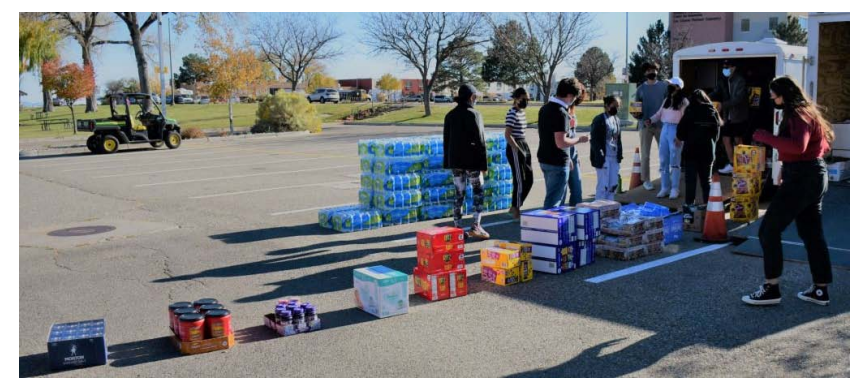
LAHS Interact Club members organized supplies Thursday for individual families in need in the eastern part of the Navajo Nation.