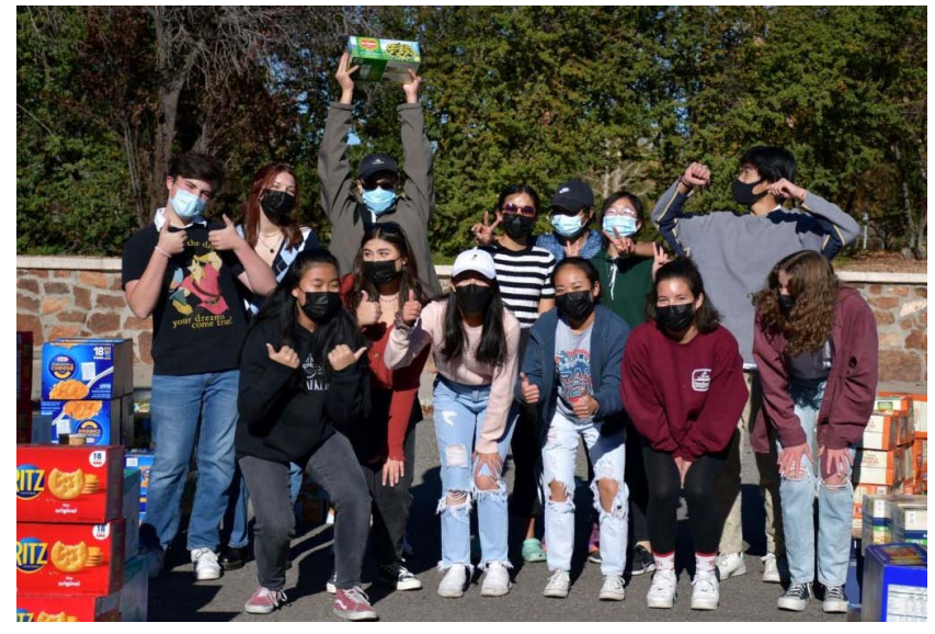
Almost done! LAHS Interact Club members recently packed food for residents of the Navajo Nation. The supplies will be delivered Nov. 20 and Dec. 4.