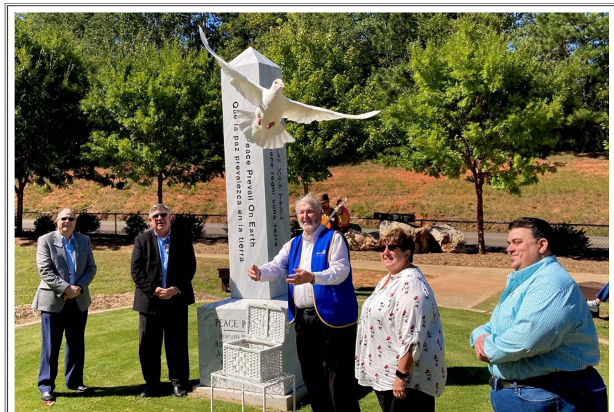
Rotary Club of Jasper releases a symbolic dove during a Peace & Unity Day event on September 21.

To top it all off, Rotary Clubs across Georgia were celebrating the day with a wide array of special events to help bring peace into each community in a unique and positive way. Outlined below are a series of links that will lead you to a variety of stories and photographs from some of the awesome programs that took place in District #6910 on the International Day of Peace.