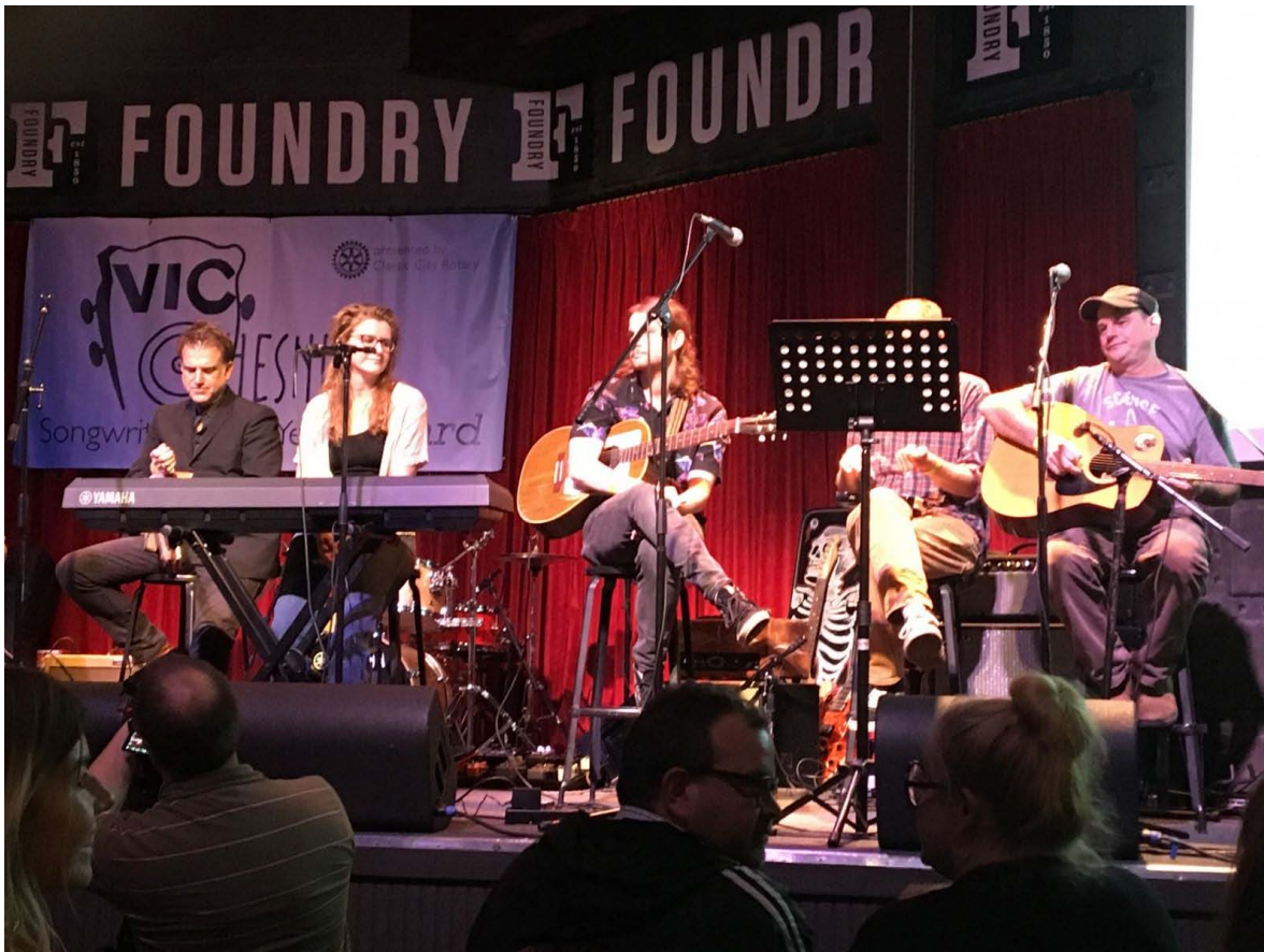
"The 2019 Vic Chesnutt Songwriter of the Year Award outstanding five finalists."