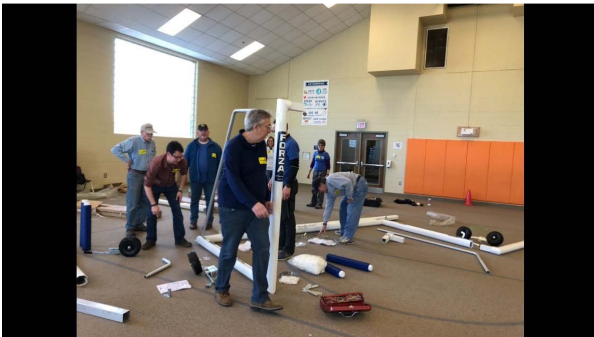
"Club Members following some pretty elaborate directions dealing with the building of soccer goals for the students at JJ Harris Elementary School."