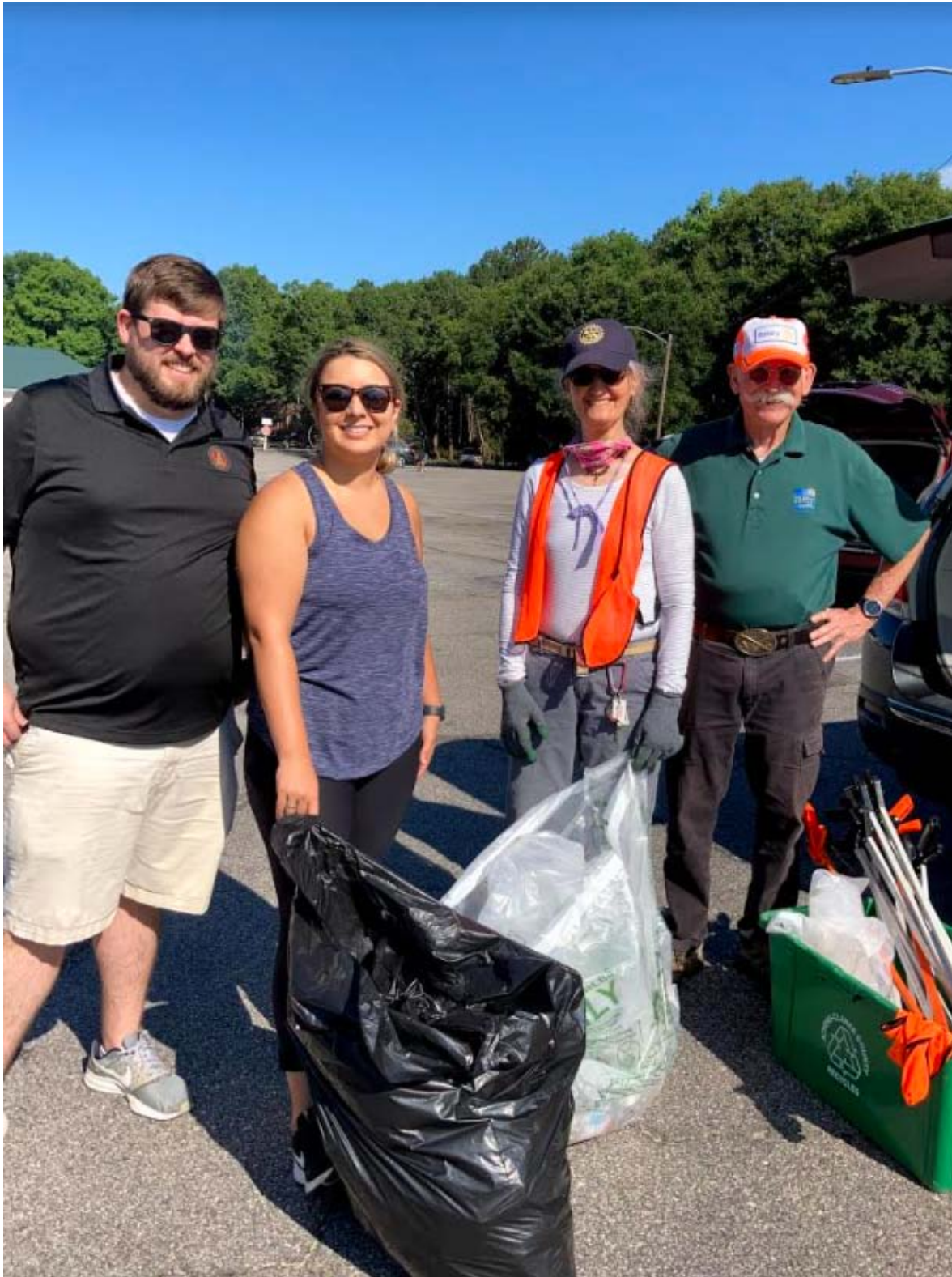
"Club Members helping to Keep Athens Clarke County Beautiful on a lovely Saturday morning. Sunset Avenue looks great. Thanks Rotarians!"