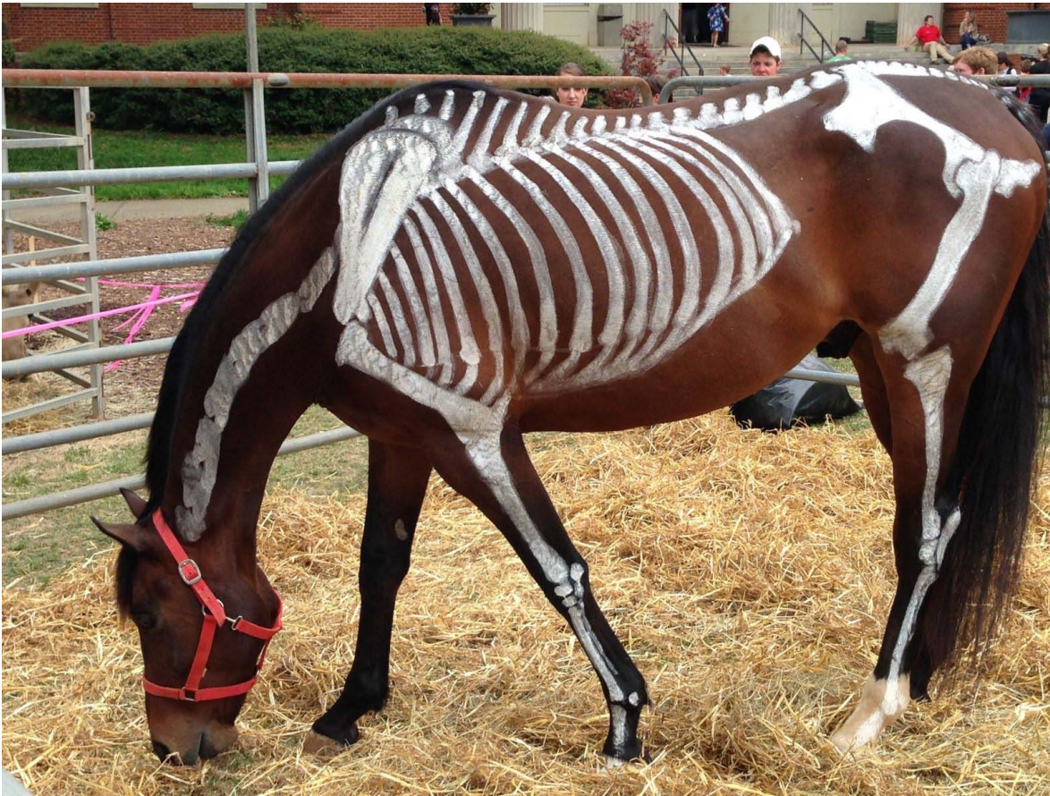
"It was a fun time for our Club Members during their visit to the new UGA Veterinary School."