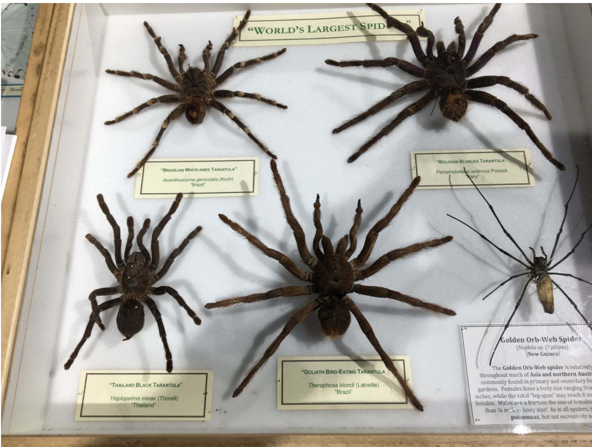
"When our Club Members visited the UGA Museum of Natural History no one was quite certain where these little critters would be found."